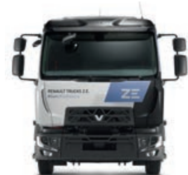
RENAULT TRUCKS D Z.E.