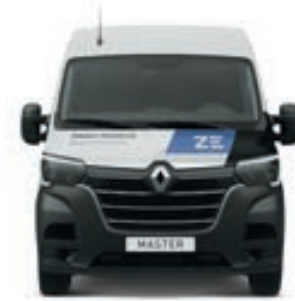
RENAULT TRUCKS MASTER Z.E.