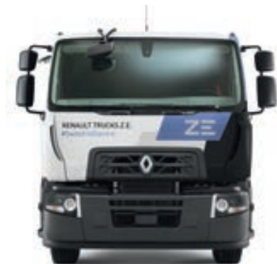
RENAULT TRUCKS D WIDE Z.E.